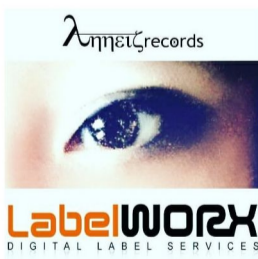
Sienná's label Anneis Records

"Q.o.S" was released in 2017 via Sienná's label Anneis Records , features ten tracks, and showcases the upcoming artists incredible versatility, and ambitious venture into the experimental genre.